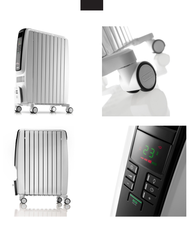
TRD4 0820E - TRD4 1025E